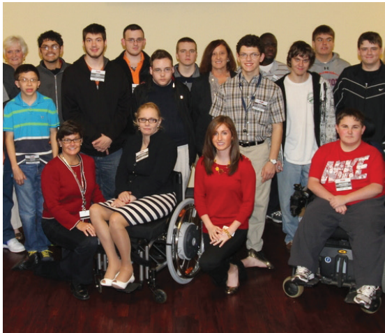
Quantum Speak Out at Disability Mentoring Day