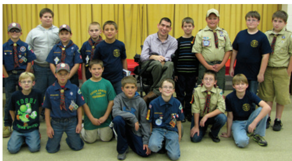
Quantum Speak Out with Cub Scout Pack 17

Provided free of charge to the community, Quantum® Speak Out offers highly respected speakers and personalities with disabilities, sharing with your group their enlightening presentations of living successfully with challenges. Their messages are educational, engaging and, yes, inspiring. Most importantly, a Quantum Speak Out speaker will provide your group with the invaluable lesson that people with disabilities really are just people, after all – that the inclusion of all within society benefits everyone.