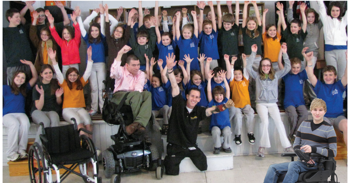
Quantum Speak Out at the Geneva Christian School in Olyphant, PA

At Quantum Rehab®, we're dedicated to supporting the success of those with disabilities in all of life's aspects. Through Quantum Speak Out, a community outreach and disability awareness program, our goal is to help promote the importance of embracing diversity in the community at large, encouraging the success of all abilities.