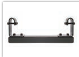
Rear Accessory Bar MSRP: $100