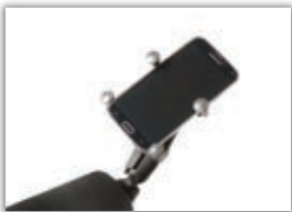
Phone Holder MSRP: $50