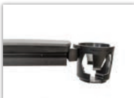
Cup Holder Complimentary with TRU-Balance® 3

Not all items shown are available on all products. Please contact your authorized Quantum® provider for details.