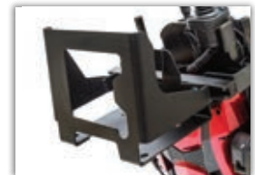
Trilogy Vent Tray MSRP: $400