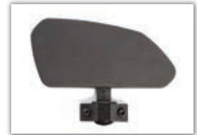
Clothing Guards (Pair) MSRP: $200