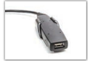
USB Mobile Device Charger MSRP: $175