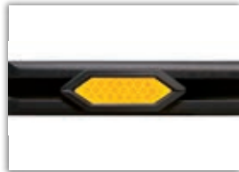
Reflector Kit MSRP: $50