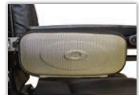
Glove Box MSRP: $125