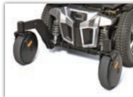
8" Caster Wheels (4) MSRP: $150