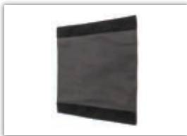
Privacy Flap (3 sizes) No charge on recline seating MSRP: $35