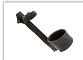
Oxygen Holder MSRP: $200