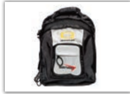
Quantum® Backpack MSRP: $75