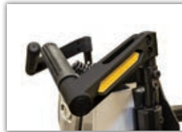
Push Handles (Pair) MSRP: $175