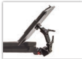
Tablet Holder MSRP: $375