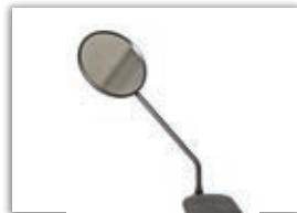
Rearview Mirror MSRP: $50