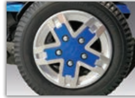
Drive Wheel Accent Colors MSRP: $49.95