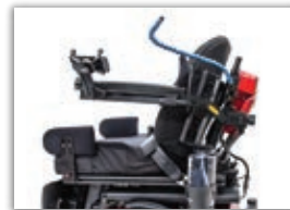
Hydration System MSRP: $200