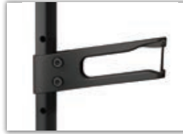
Backpack Holders (Pair) MSRP: $50