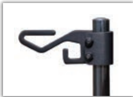
Personal Item Hook MSRP: $50