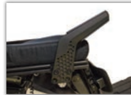
Transfer Bars (Pair) MSRP: $200