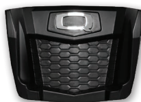
Back in Black

1) Speed varies with user weight, terrain type, battery charge/condition, and tire pressure.