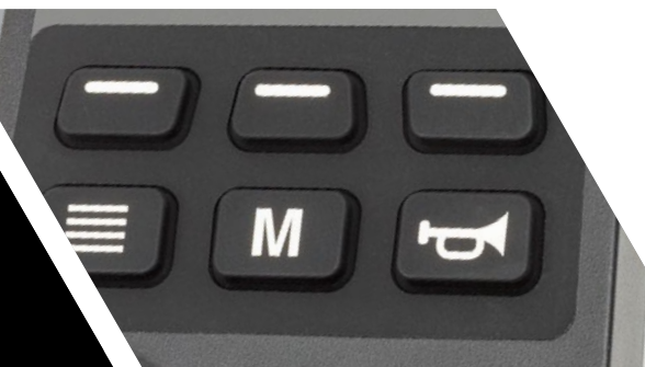
Programmable soft keys