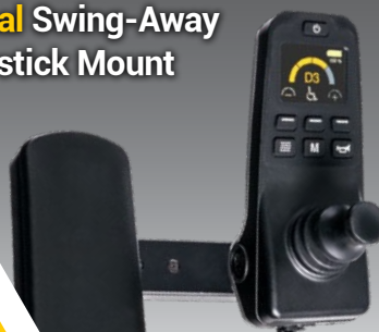
Optional Swing-Away Joystick Mount

Quantum® Power Chairs are FDA Class II Medical Devices designed to aid individuals with mobility impairments.