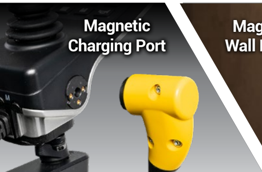
Magnetic Wall Holder