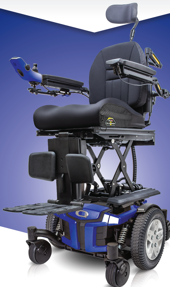
Q6 EDGE® HD shown in Midnight Blue with iLevel® technology