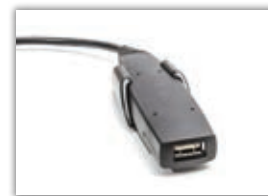
USB Mobile Device Charger MSRP: $175