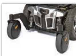
8" Caster Wheels (4) MSRP: $150