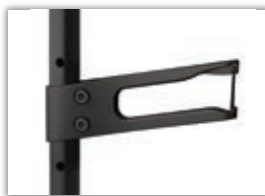
Backpack Holders (Pair) MSRP: $50