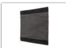
Privacy Flap (3 sizes) No charge on recline seating MSRP: $35