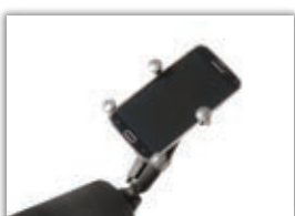
Phone Holder MSRP: $50