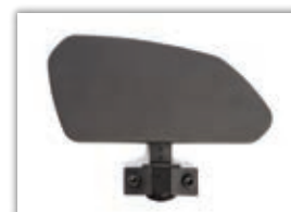
Clothing Guards (Pair) MSRP: $200