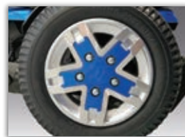
Drive Wheel Accent Colors MSRP: $49.95