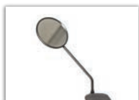
Rearview Mirror MSRP: $50