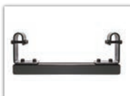
Rear Accessory Bar MSRP: $100