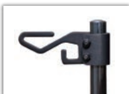
Personal Item Hook MSRP: $50