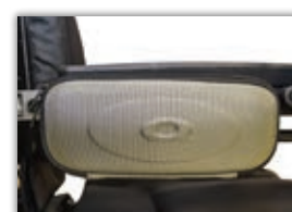
Glove Box MSRP: $125