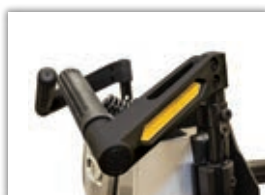
Push Handles (Pair) MSRP: $175