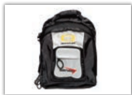
Quantum® Backpack MSRP: $75