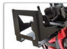
Trilogy Vent Tray MSRP: $400