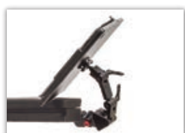
Tablet Holder MSRP: $375