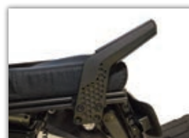
Transfer Bars (Pair) MSRP: $200