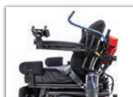
Hydration System MSRP: $200