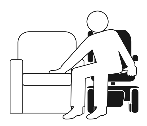
Figure 9. Recommended Transfer Position