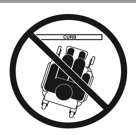
Figure 5. Incorrect Curb Approach