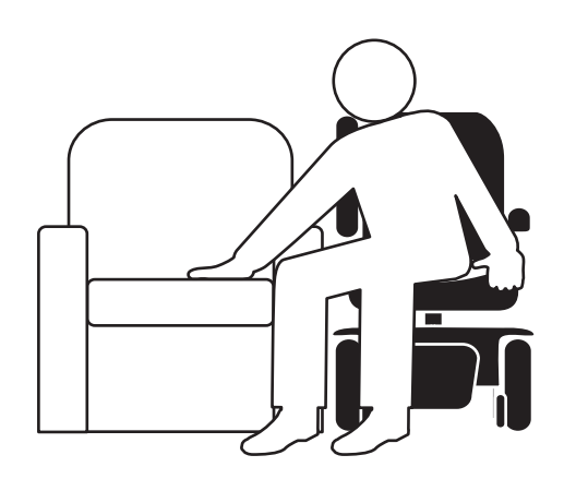
Figure 9. Recommended Transfer Position