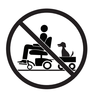
Figure 1. Weight Limitation