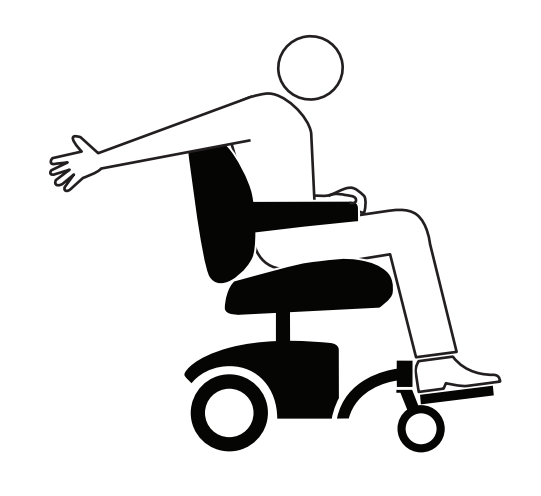
Figure 8. Improper Reaching and Bending