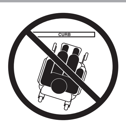
Figure 5. Incorrect Curb Approach