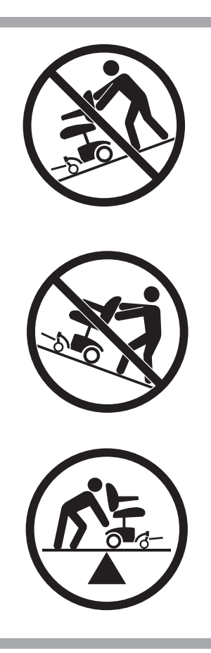
Figure 3. Freewheel Mode

Do not place the power chair in freewheel mode while the controller power is on. Always turn the controller power off before engaging or disengaging freewheel mode.